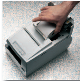
Easy Paper Loading