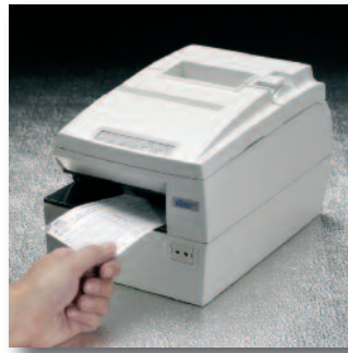
Top or Bottom MICR